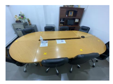
The providing of lunch boxes and the seat management in cafeteria for social distance